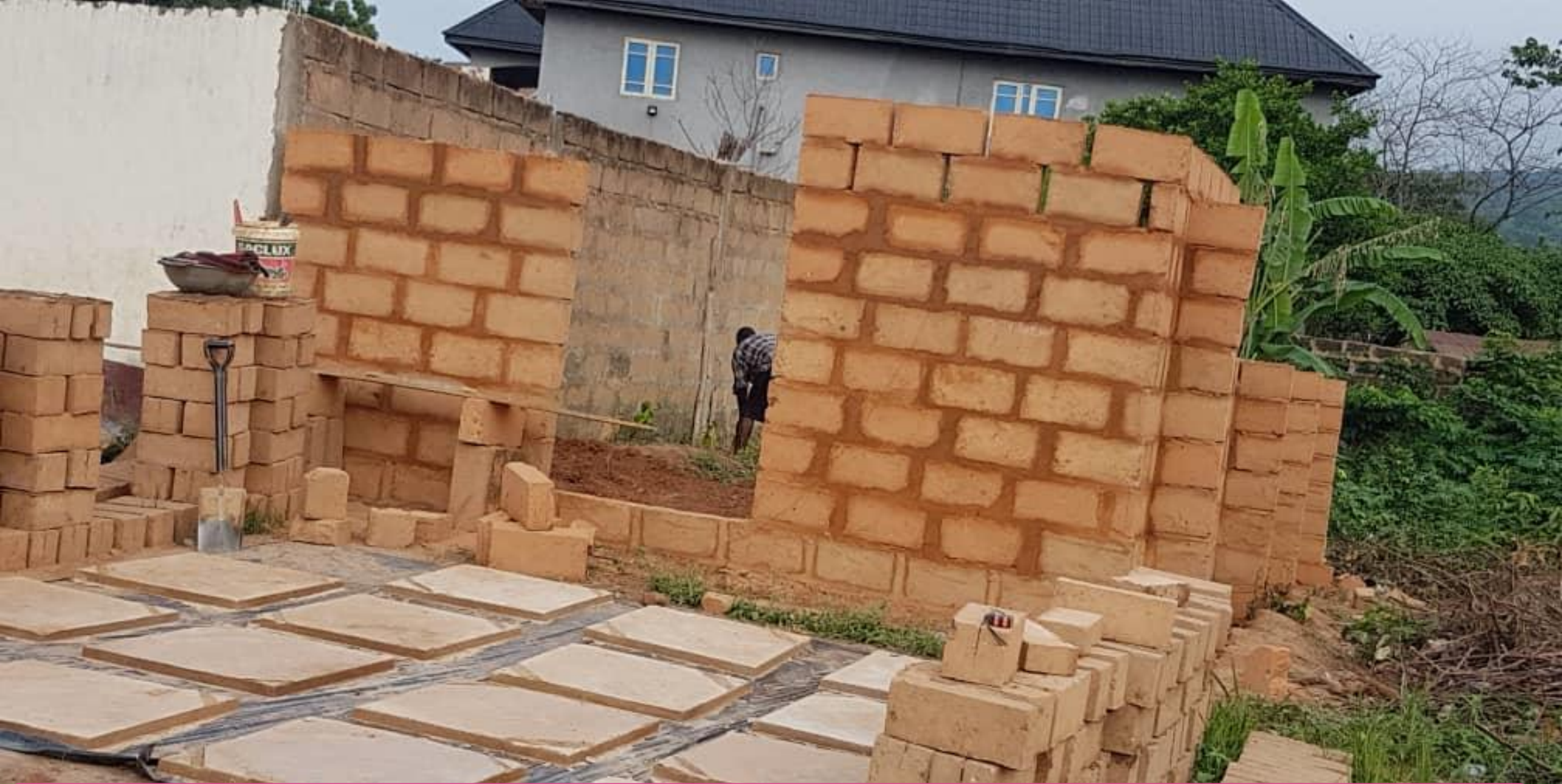
Constructing HIFA Grasscutter shed in Umuchieze