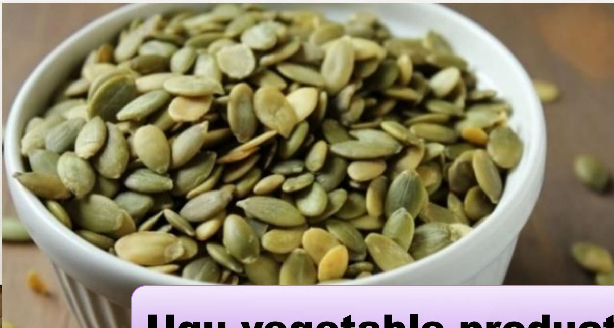
Ugu vegetable production agribusiness