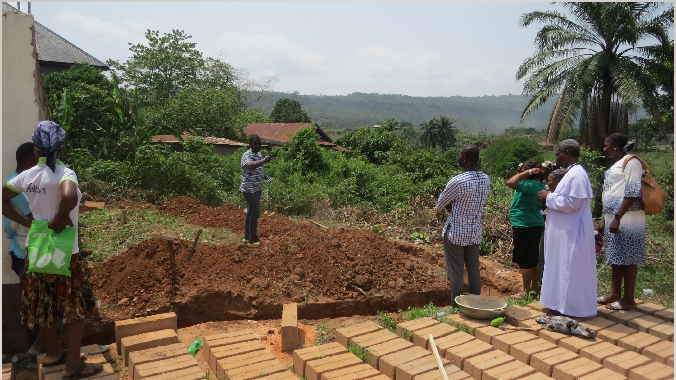
HIFA project site in Abia state for the small animal production