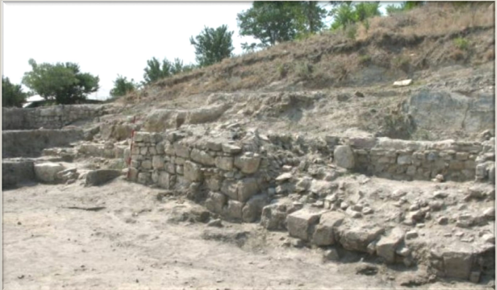
Nufaru Soils (Archeological section)