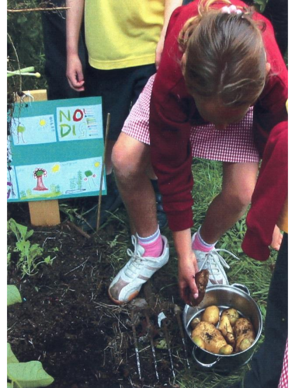
Food for life

Moving beyond organic is being developed and promoted by the Good Gardeners Association, a national membership based charity (registration no. 255300).