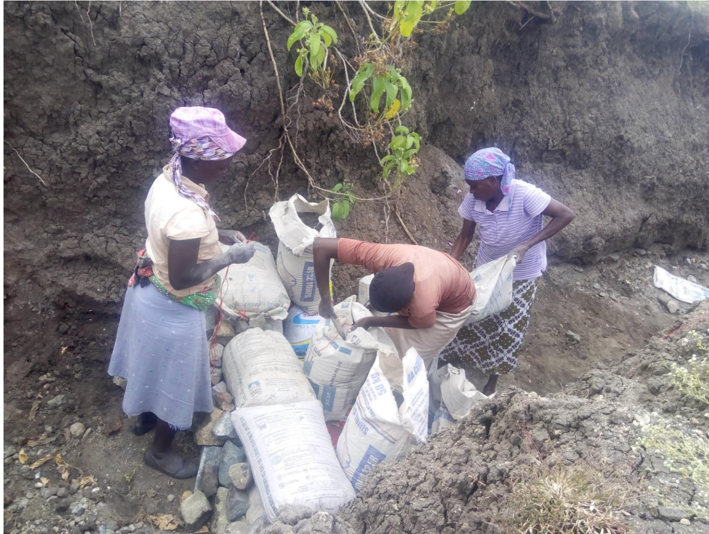
Women building a check dam