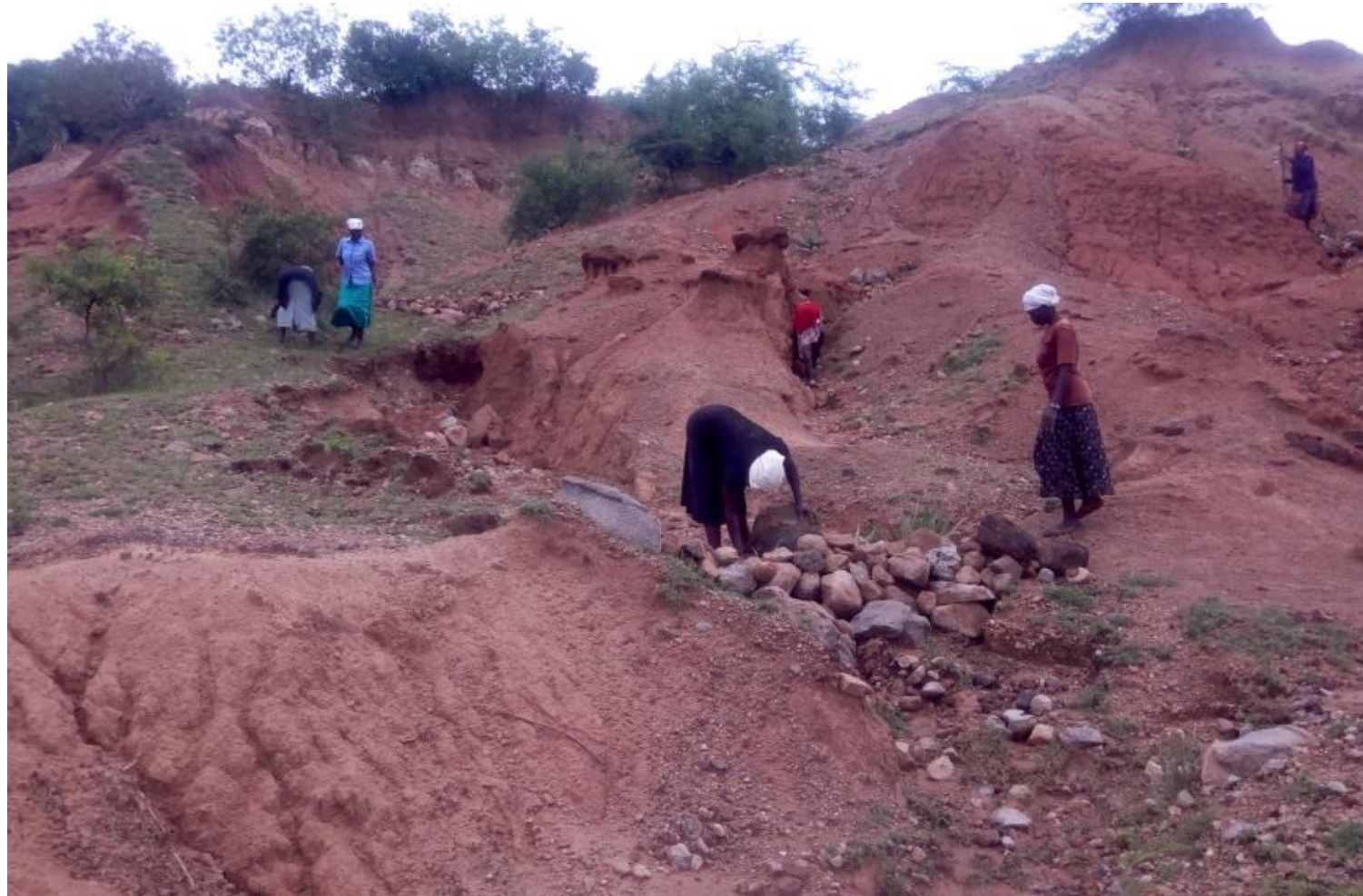
Erosion control on Rusinga Island