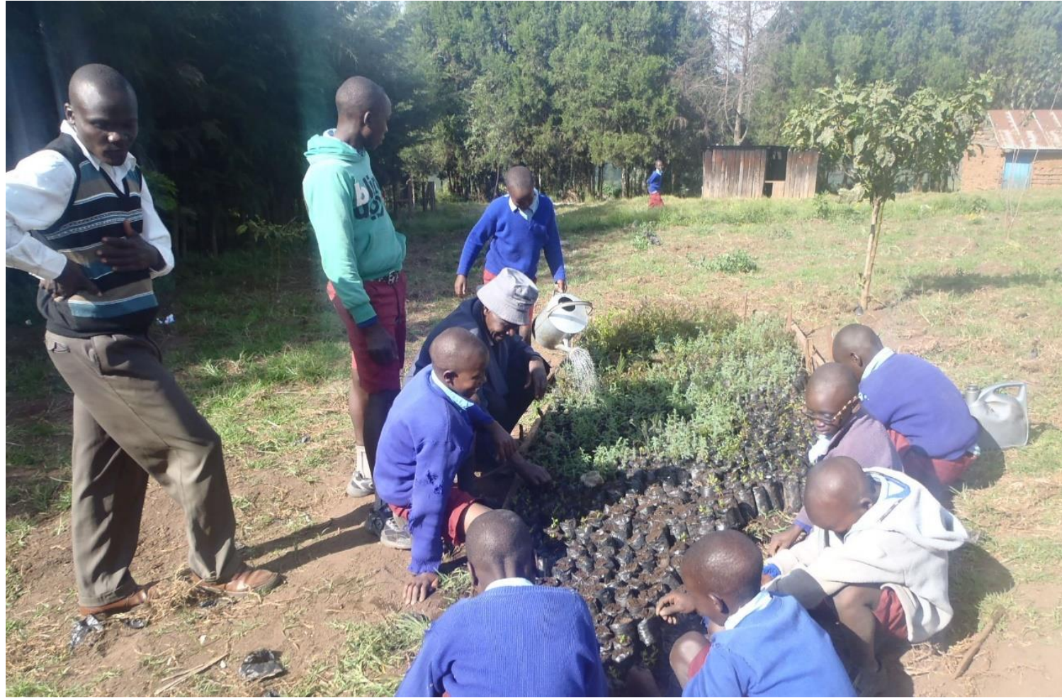
Working at a tree nursery with students